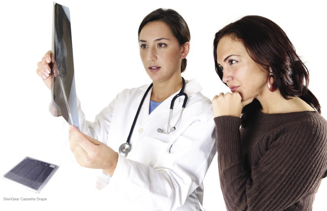
SteriGear Cassette Drape